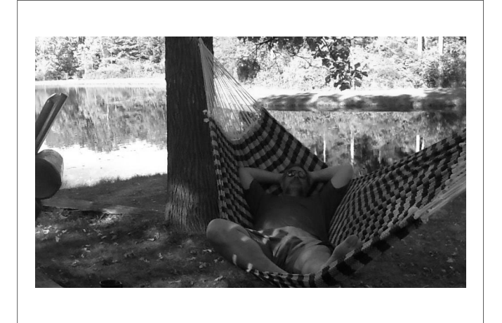
Physical Therapy was rough after my procedure. Here I am, hard at it.

The biggest overall reasons have been health related. This year has been one of challenges as one of my office staff members required extended medical leave time to get through a rough time. Thank God, everything is now okay, but there was a lot of extra work that had to be